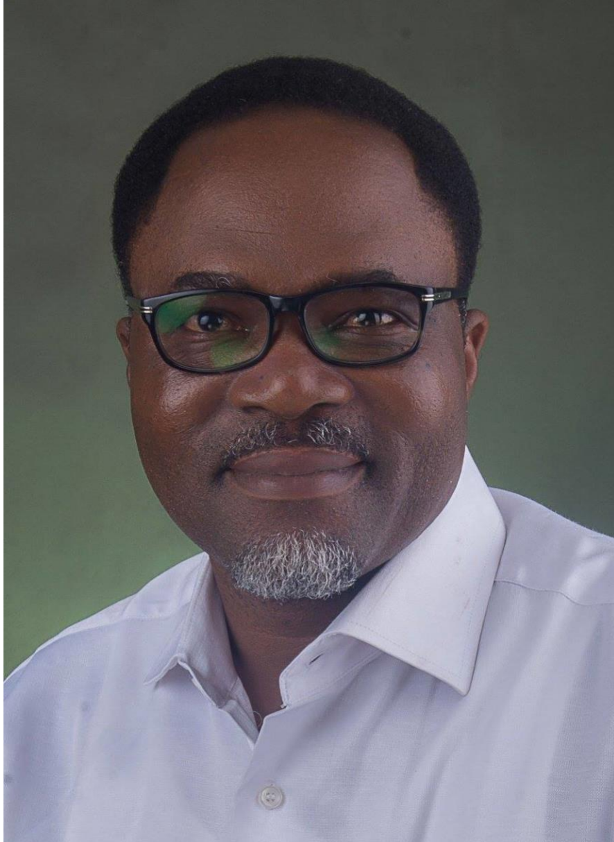
In Loving Memory and Dedication to Ikeogu Oke (1967 - 2018)